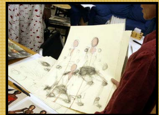
Charcoal and wash drawing

Nestled at the base of Castle Mountain, the studio overlooks meadows, a pond and great vistas of the Blue Ridge Mountains, all ideal for sketching and painting.